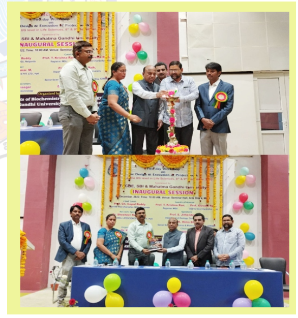
Two Day Workshop on Designing Projects in Life Sciences

driving both social and economic development as well as an increasing demand for