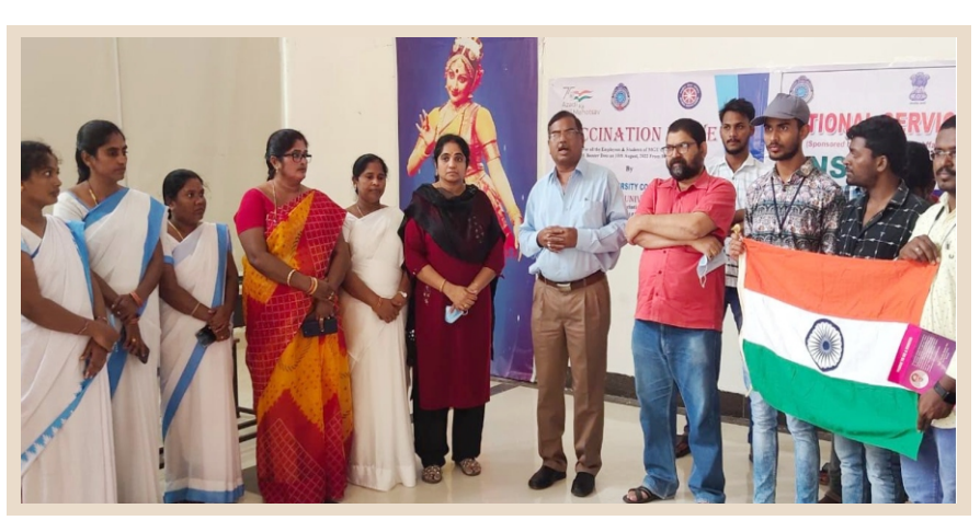
COVID-19 Vaccination Programme at MGU

Around 100 staff members were given Covaxin & Covishield as vaccine 1st & 2nd doses as per their vaccination schedule.