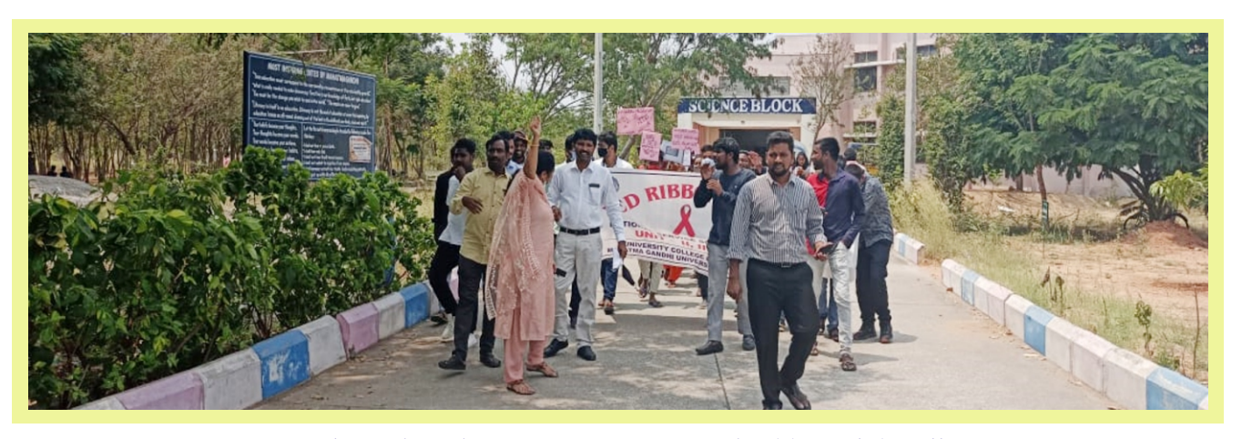
Faculty and Students Participating in Red Ribbon Club Rally

In the context of HIV prevention program in the country, mobilizing and organizing youth focussed to prevent them from HIV infection is the need for the hour. While looking at the statistics pertaining to HIV infection among youth in the country, it