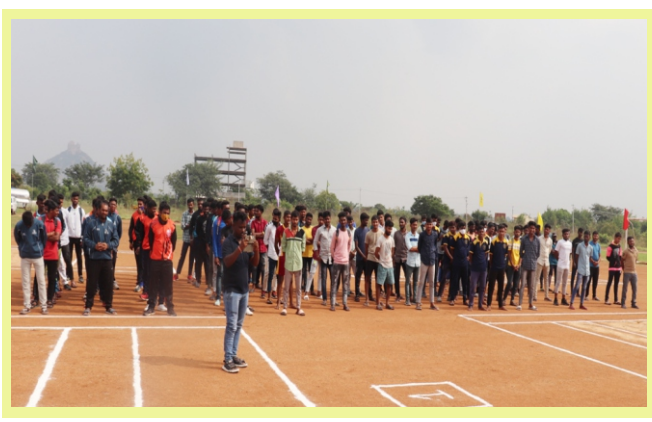
PECET-2022 EVENTS AT MGU

Telangana State Physical Education Common Entrance Test (TS PECET - 2022) conducted by Mahatma Gandhi University